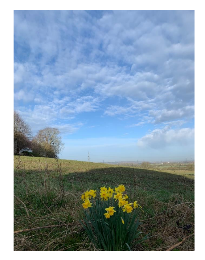
Above: Fiona Ardern