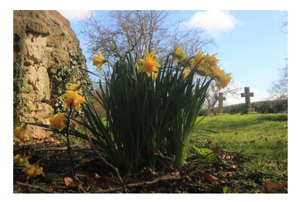
This page: all Joe Cullen